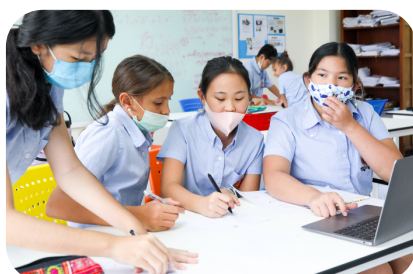
Online Maths Competition