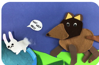
Virtual Film & Animation Festival