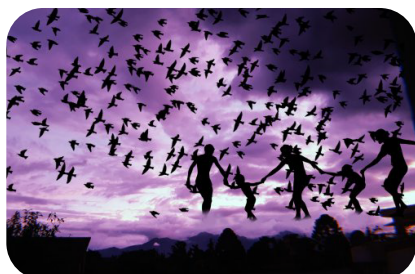
Virtual Photography Festival